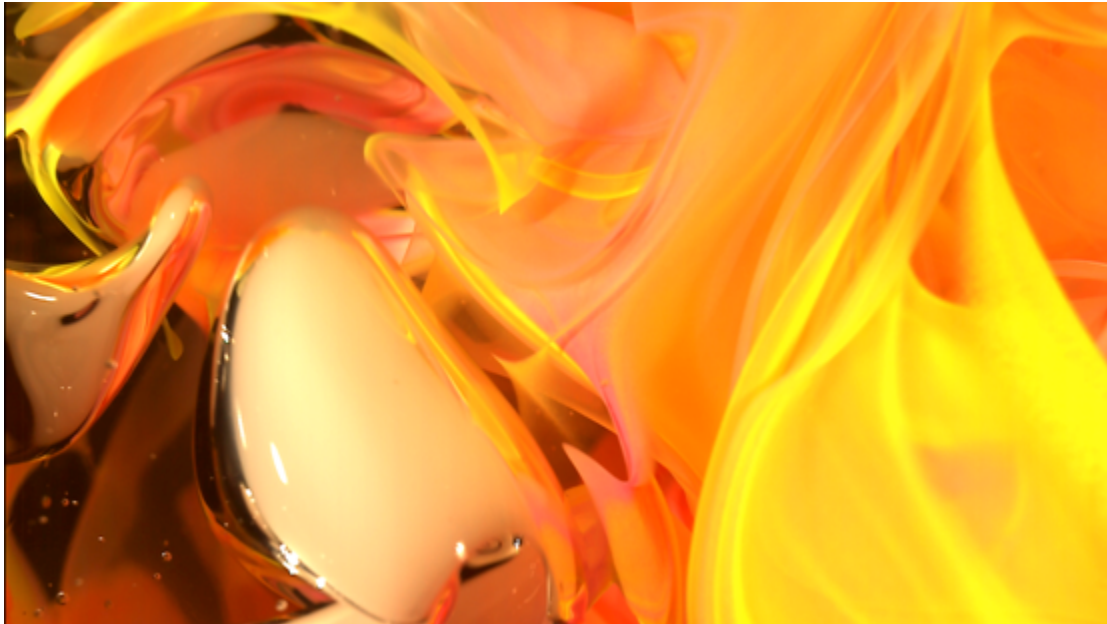
Image: Genesis -Pink&Yellow- , 2016, Video (color, sound), 5 min, 4K resolution (Ultra HD)