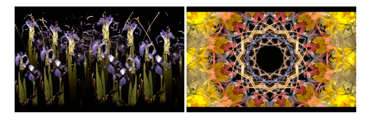
Image (L-R): Utsuroi , 2015, Video (colour, sound), 8 min 57 sec, 4K resolution (Ultra HD) Tears of Flower , 2015, Video (colour, sound), 7 min, 4K resolution (Ultra HD)

With Tears of Flower , there is more a sense of birth than destruction. The component and the whole come together in a curious amalgam of kaleidoscopic visuals. Multiple petals are conjoined in swirl-like patterns, looking much like flowers reborn with composite parts. Interlaced with clear droplets of water, notably the 'tears', this work also details Tosa's attempt to capture the invisible workings of a human's mind. Using flowers as a surrogate for humans, she articulates these obscured thoughts and feelings through abstract forms.